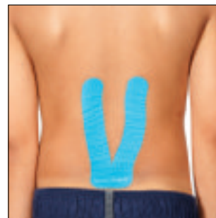
Low Back Application of Y-PowerStrip