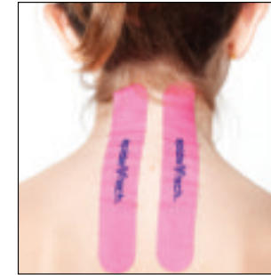
Central Neck Application of I-PowerStrip