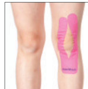
Central Knee Application of Y-PowerStrip