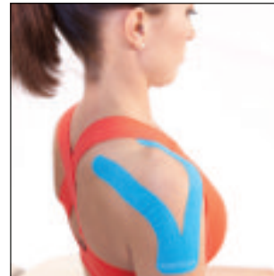
Shoulder (Rotator Cuff, Shoulder Mechanics) Application of Y-PowerStrip